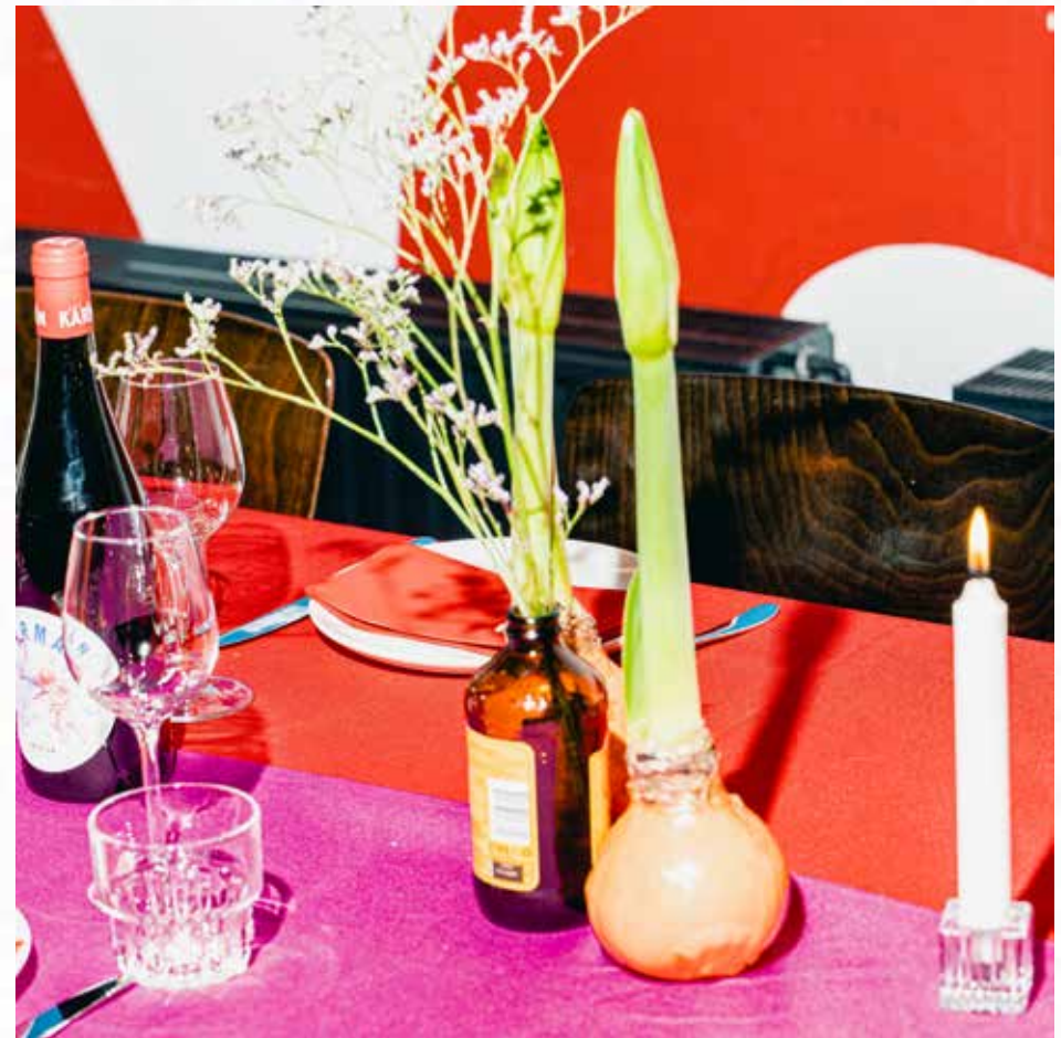
Foto-impressions are from previous years. Volkshotel will look different this year. Red-redder-redst will be this years motto.